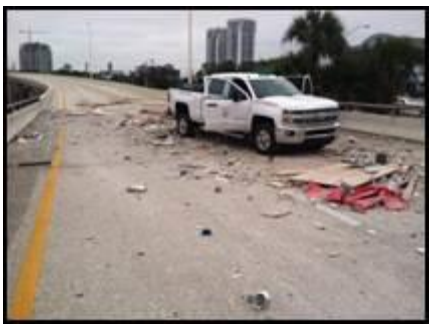
Back To Basics - Watch the Road!